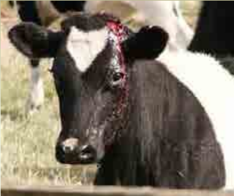
Dehorning of cattle