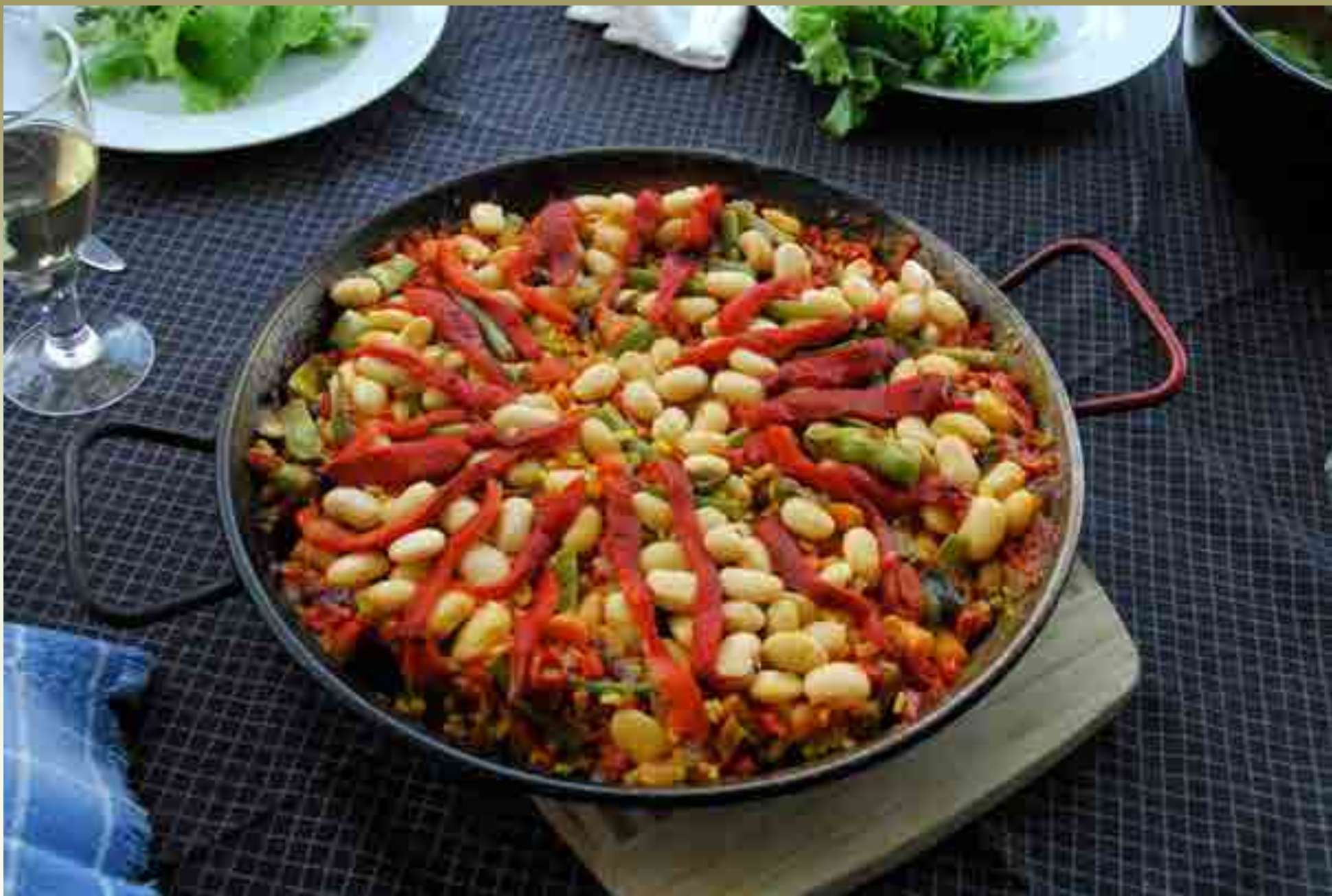
Vegan Paella